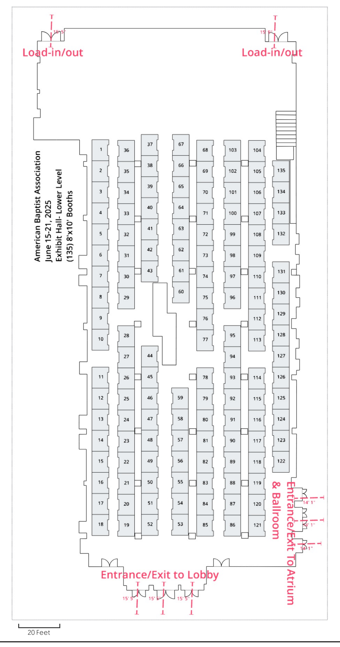
Hall 1 (Lower Level) for American Baptist Association - June 15, 2025 at 12:00 AM